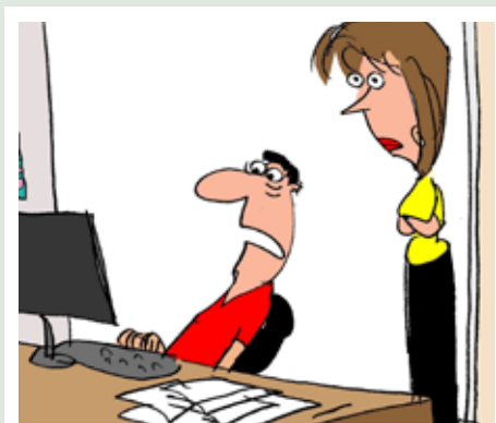
“‘Unexpected error.’ It stopped being ‘unexpected’ after the first 10 times it happened.”