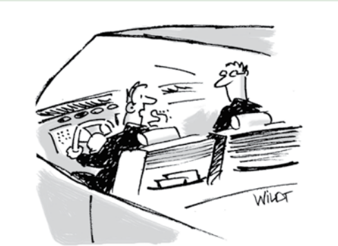
“I always play the GPS through the back-seat speakers. That’s where I’m used to receiving instructions.”

Will protecting your business from a cyber-attack require a good amount of time and money? Absolutely. Can you afford to ignore the prevalence of cyber-attacks any longer? Statistically, no. The sad truth is that 60% of SMBs that fall victim to a cyber-attack end up shuttering within six months. Don’t put yourself in that kind of position. Instead, take your business’s cyber security seriously.