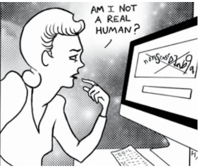
“It was after her third failed attempt at deciphering the captcha that Rachel began to suspect ...”